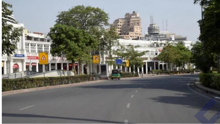
One of the main functions of the municipal corporation is the construction and maintenance of roads.