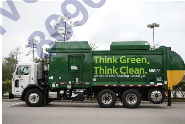
Municipal Corporation in order to save money gives contract to the private companies for the collection of garbage.

One of the important functions of the municipal corporation is to keep the city clean. This is done by appointing sweepers who clean the streets and roads of various localities. The collection and disposal of garbage is an important part of keeping the city clean. Nowadays, the municipal corporations in order to cut the cost of garbage collection, hire many private contractors who collect and process the garbage. This system is called sub contracting . In this system of sub contracting, the private company carries out the work which was earlier done by the government. The municipal corporation of the city of Surat has done a recommendable work in cleaning the city of its garbage after the breakout of plague in 1994.