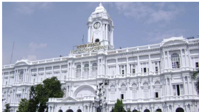
The building of the Chennai Municipal Corporation. It is the oldest Municipal Corporation in India.