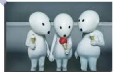
Advertisements are a major source of earning for the media