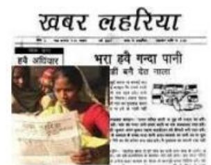
Khabar lahariya has played an important role in highlighting the local issues in the Chitrakoot District of Uttar Pradesh