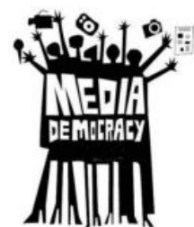
Media play an important role in shaping the public opinion