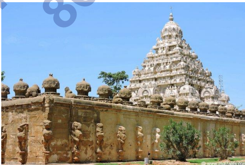
Kalaisnathar Temple in Kanchipuram was constructed by the Pallavas in the seventh century