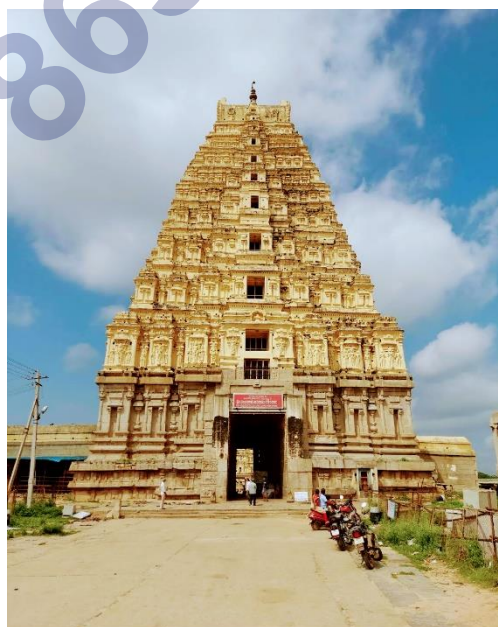
The Virupaksha temple at Hampi

The Virupaksha temple is one of the most famous temples in the city. The Mahanavmi festival was celebrated with a lot of vigour and energy.