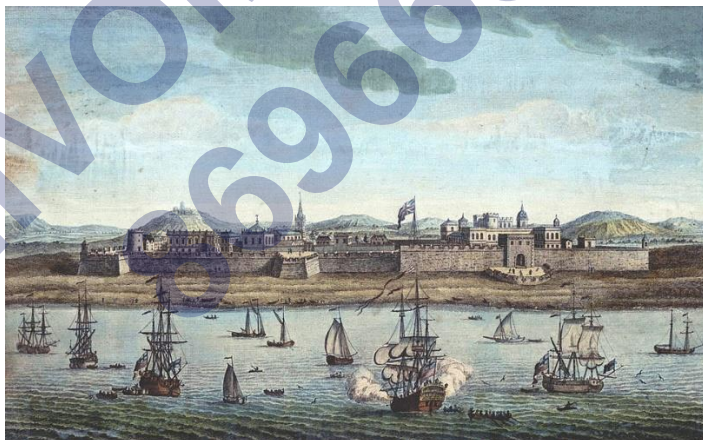
St. George Fort in Madras in the eighteenth century

By the end of the seventeenth century, the European traders began to gain prominence. They traded in spices and textiles which were in great demand in the European countries. The English, the French and the Dutch formed their East India Companies in order to gain access to the Indian trade. Gradually, the Europeans powers due to their naval superiority gained control of the sea trade and forced the Indian traders to work as their agents. The English emerged as the most successful economic and later political power in India.