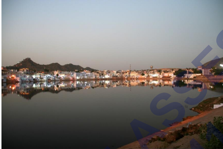
The Pushkar Lake near Ajmer