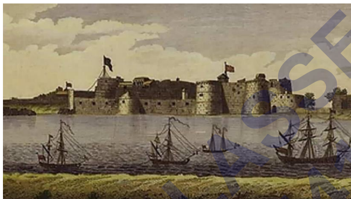
The city of Surat in the late seventeenth century