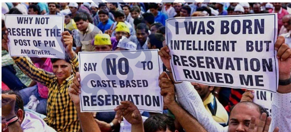
People protesting against caste-based reservation and asking for reservation on the basis of economic status

On November 16 1992, the Supreme Court responded to a case filed by lawyer Indira Sawhney and other against 27% reservation for the Other Backward Classes in government services and in institutions. While justifying the reservation for the OBCs on account of atrocities faced by them under the Varna system, it cautioned against extending the tenure of such reservation beyond ten years. It also held that reservation should be done away with once a particular section is represented adequately in society.