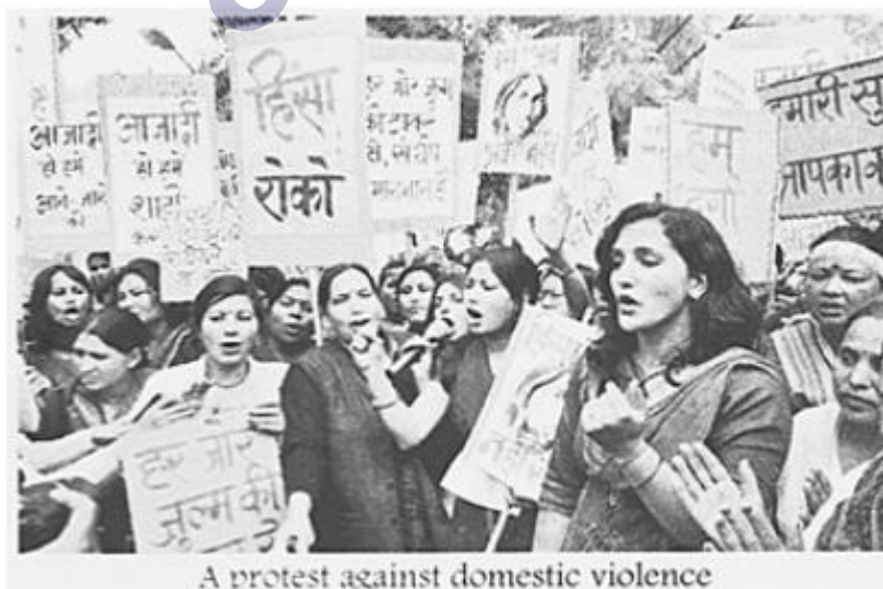
A protest against domestic violence

The Protection of Women from Domestic Violence Act (2005) is an example of how the people can put pressure on Parliament to enact a law. The need for such a law had been felt by women all over the country for a long time. After a decade-long struggle, with women's organisations and the Lawyers Collective (comprising lawyers and law students) at the forefront, the bill was introduced in Parliament in 2002. The law defines domestic violence as any kind of ill-treatment, including physical violence, mental cruelty and being deprived of property. It recognises a woman's right not only to be protected from violence, but also to not being thrown out of a shared home by her husband, son, brother or other relatives or people she is living with. This law, in fact, is an example of how special laws are needed to protect the rights of the weaker sections of society.