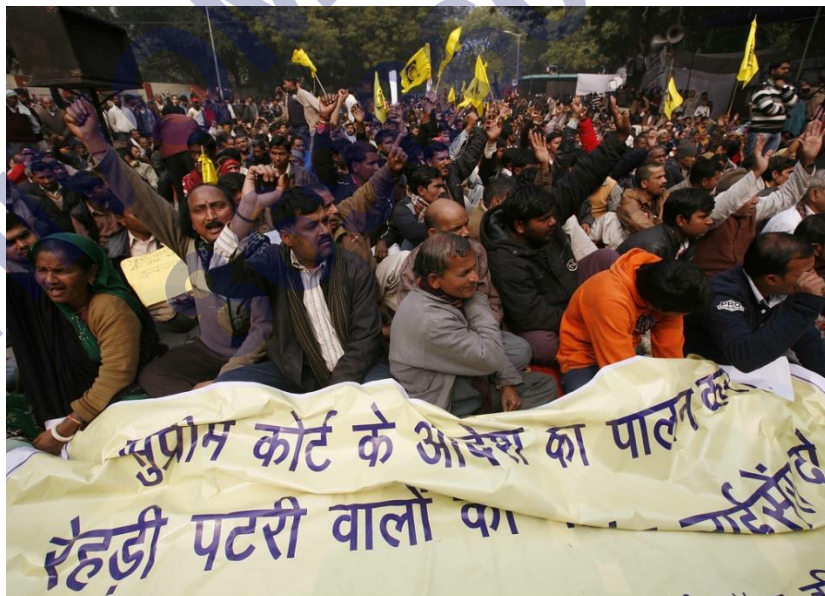
Street vendors protesting for their rights

Through the years, street vendors organized themselves into trade unions and associations and got the backing of several NGOs. In many cases filed before courts, they got judgments in their favour because the courts felt that the Right to Livelihood is a part of the Right to Life. In 2010, the Supreme Court recognized street vending as a source of livelihood and directed the government to work out a law to protect street vendors from harassment and to demarcate vending zones. The law was passed in 2014. Under the law, civic authorities are supposed to provide licences to street vendors and demarcate vending zones where vendors can offer their services to the public.