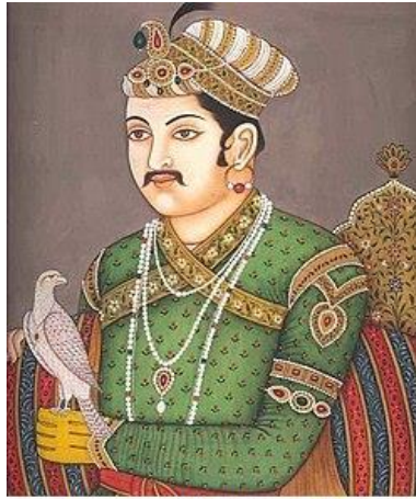
Akbar - (1556-1605)