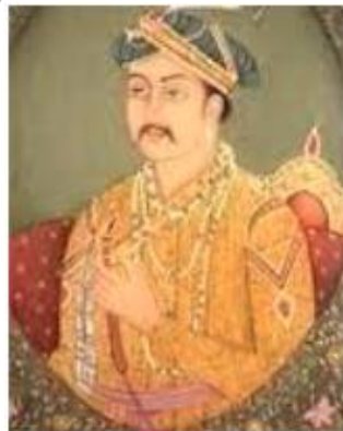
Raja Todar Mal was the revenue minister in the court of Akbar