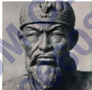
The Mughals were proud of their Timurid ancestry

The Mughals were the descendants of two great lineages of rulers. Babur was the descendant of Genghis Khan (ruler of the Mongol tribe of China and Central Asia) from his mother's side and Timur from his father's side. Mughals did not like to be associated with Genghis Khan as he had killed several innocent people during his lifetime. Further, he was also linked to the Uzbeks who were their Mongol competitors. On the other hand, the Mughals were proud of their Timurid ancestry as he had captured Delhi in 1398.