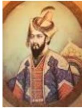
Babur was the founder of the Mughal rule in India