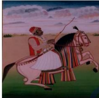
Raja Man Singh was a loyal friend of Akbar. He was a mansabdar in the Mughal court with a zat rank of 5,000