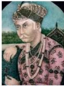
Akbar followed the principle of sulh-i-kul and also implemented it in many areas of governance