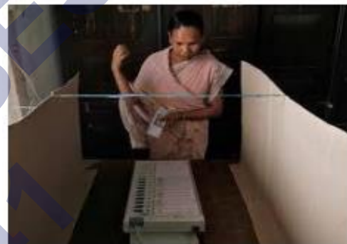
People in State Assembly Elections choose their own representatives