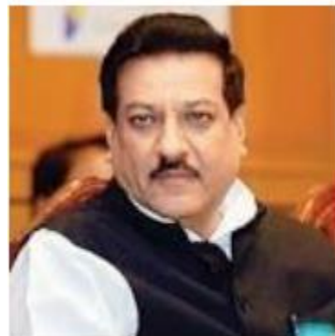
Prithviraj Chavan, besides being the Chief Minister of Maharashtra (from 2010-14) was also a MLA of Karad constituency in Maharashtra.