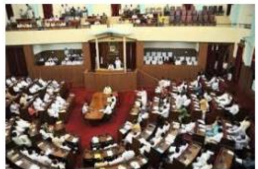
Members of the State Legislative Assembly can discuss, debate and ask questions regarding the work of the departments