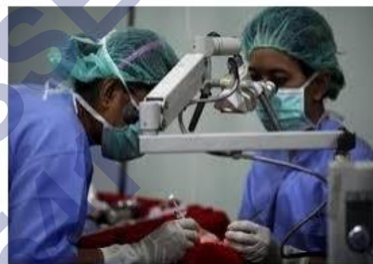
Private hospitals are generally equipped with modern medical equipments

Private health services refer to those services which are offered by privately owned clinics or hospitals. These are either owned by an individual or by an organisation. Private hospitals are generally equipped with modern medical equipments and laboratories. Usually, many facilities such as ultrasound, X-ray etc. are located within the premises of these hospitals.