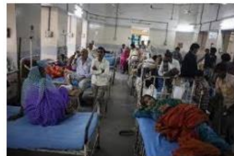
Public health care is so called as in public hospitals the cost of treatment and medicines are low. Most of the financial resources come from the taxes paid by the people.

Public health services are so named because of the following reasons: