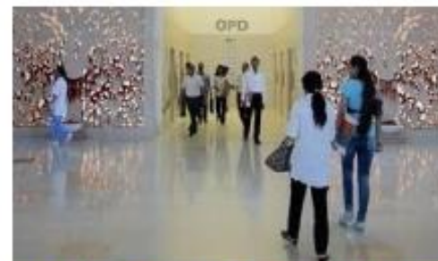
In the private hospitals, the cost of treatment is so high that common people are hardly afford them