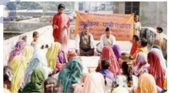
The State Governments, by allocating money to the panchayats, can improve the general health standard of the people in the villages