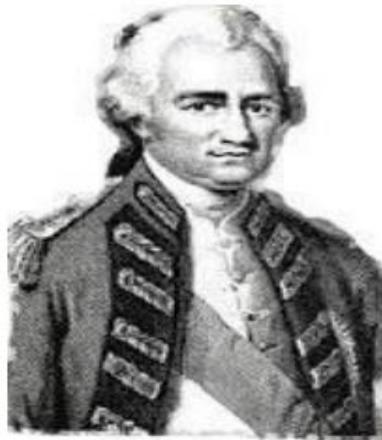
Robert Clive played an important role in establishing supremacy of the Company in India