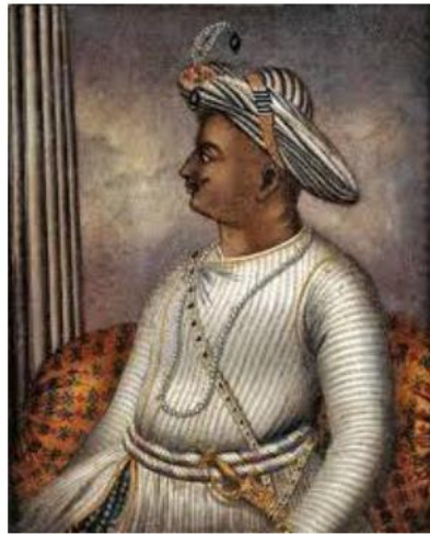
Tipu Sultan was killed in the Fourth Mysore War at Seringapatam.