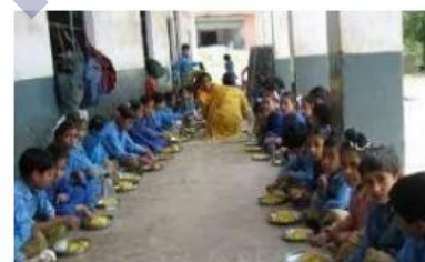
The Midday Meal Scheme has helped in reducing the caste inequalities as children belonging to different castes eat their meals together

While some people are treated unequally on the basis of the caste system, some are discriminated against on the basis of religion. In many cities, houses are not given on rent to people belonging to one particular religious community.