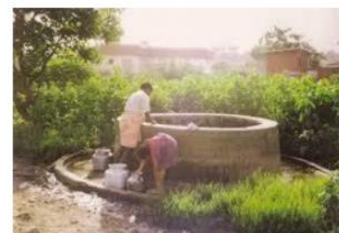
Every citizen of the country has the right to use wells, tanks and ghats maintained fully or partly out of the state funds