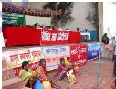
Even a popularly elected democratic government may not ensure smooth economic development

We can conclude that though democracy is the best form of government, it has not been able to reduce economic inequalities in society. Sometimes, even a government elected mostly by the poor people does not resolve the issue of poverty in the country. For example, in Bangladesh, more than 50% of its population lives below the poverty line, still the government has failed to work for the upliftment of its people.