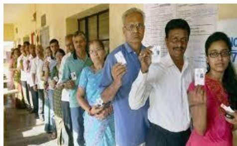
Holding free and fair elections is a major challenge faced by any democratic country today