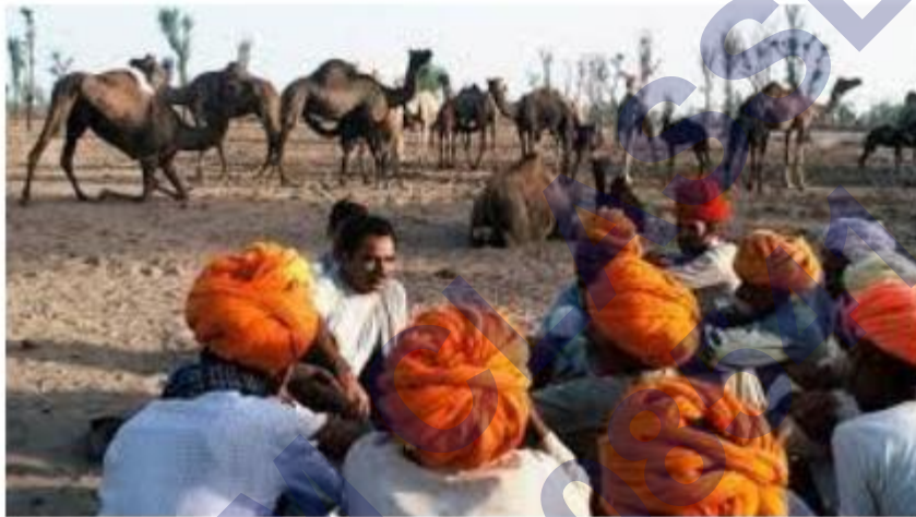
Raikas mainly live in the deserts of Rajasthan

move through different terrains and they establish relations with the farmers while moving. They also combine a range of various activities such as trade, herding and cultivation to make a living.