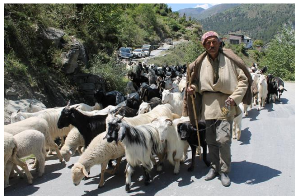
Gaddi shepherds of Himachal Pradesh