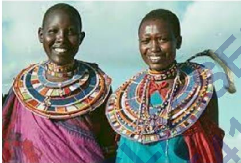
Women of the Maasai community of Kenya