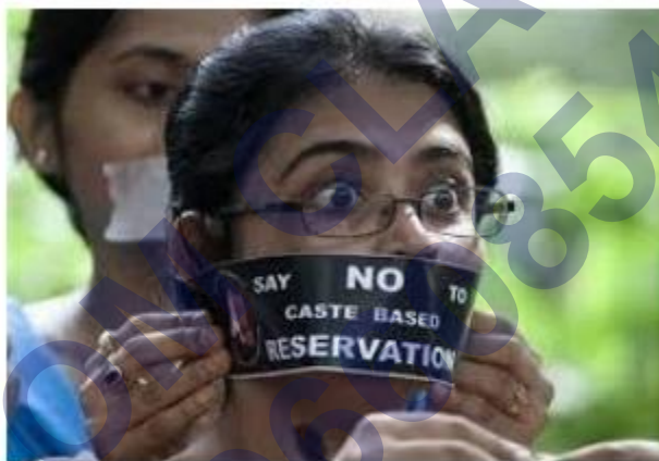
Protest against caste-based reservations