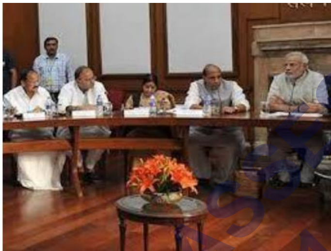
Cabinet – Inner ring of the Council of Ministers