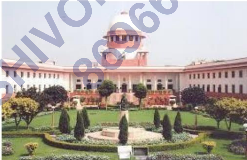
The Supreme Court of India in New Delhi

People who are not satisfied with the decision of the High Court can file cases in the Supreme Court.