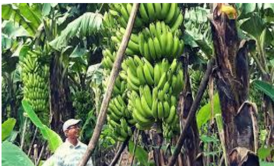
Banana plantation in Southern part of India