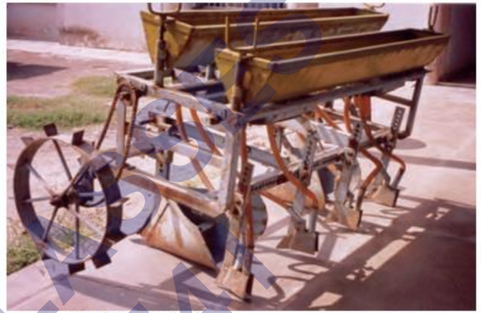
Modern technological equipments used in agriculture