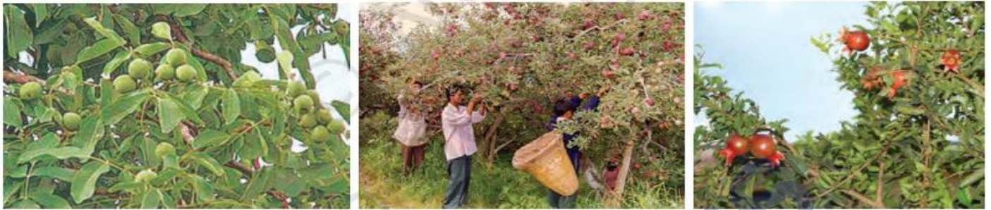
Apricots, apple and pomegranate

important producer of peas, cauliflower, onion, cabbage, tomato, brinjal and potatoes. There is a potato institute in Shirnla where study is made on various qualities of potatoes grown in India.