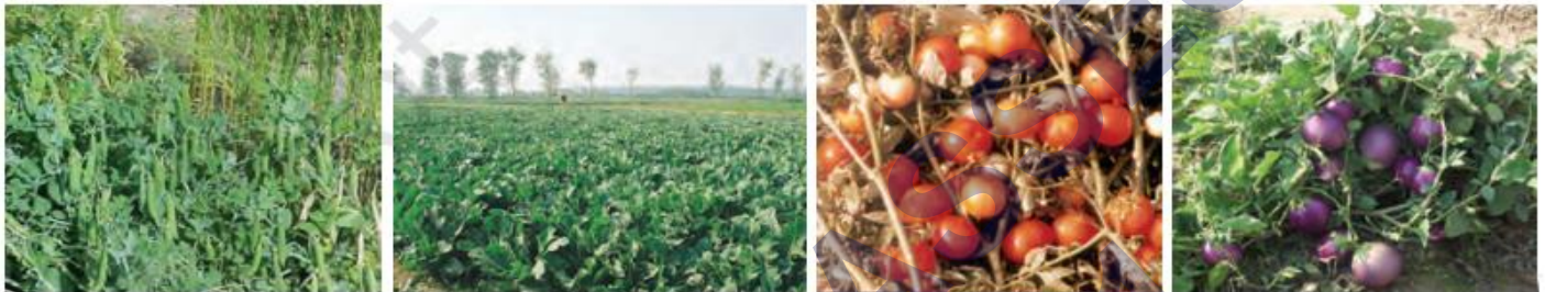
Cultivation of vegetables – peas, cauliflower, tomato and brinjal