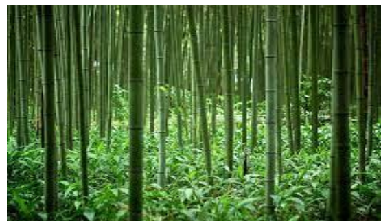
Bamboo plantation in North-east