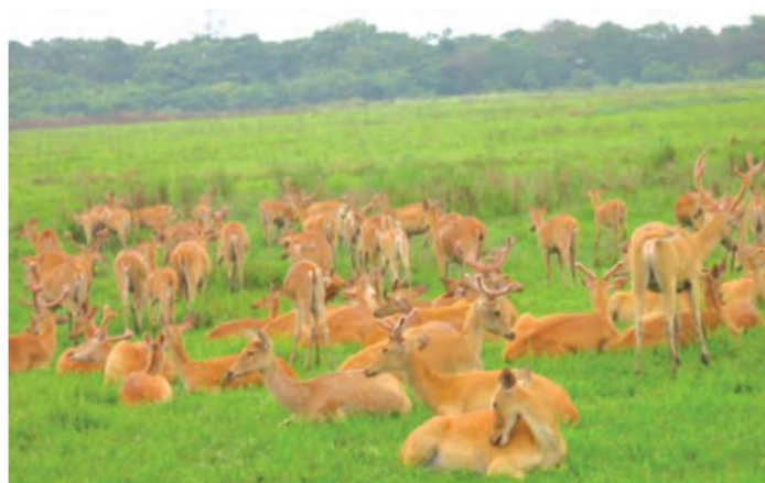
Rhino and deer in Kaziranga National Park